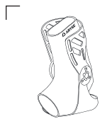
RFAST® 3D (custom rigid ankle system)